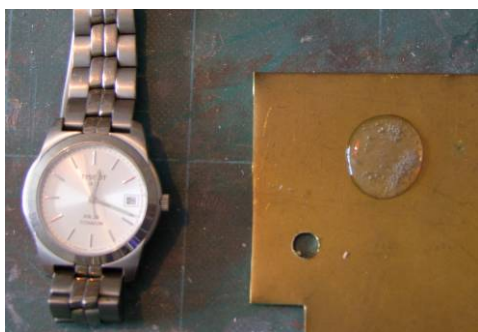
Viakal applied to the surface. Watch to show elapsed time for cleaning. It is quick.