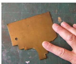
Brass from the store, fingers for scale.

The following pictures show each product being used on a badly tarnished piece of brass sheet.