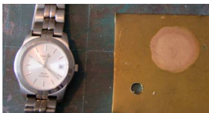
About four minutes later a bright surface. Note that Viakal leaves a coppery colour